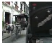
Ilocos: More Than You Can Imagine